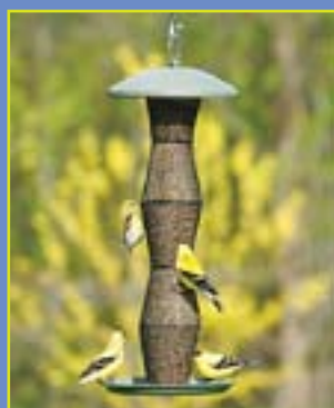
Nyjer Thistle Bird Feeders Goldfinch