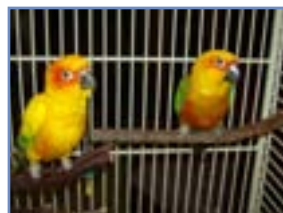
MODI & FREYJA SC & JC