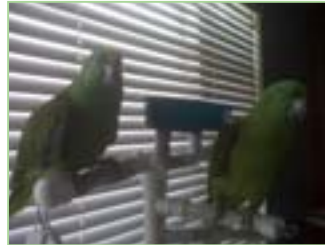
LOUIE & NEMO YNA