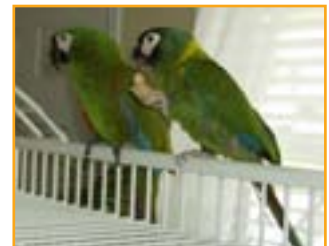
CUDDLES & AGADORE SM & YCM