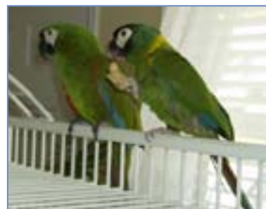
Cuddles & Agadore(SM, YCM)