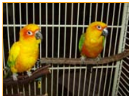
Modi (SC) & Freyja (JC)