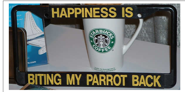
American Federation of Aviculture annual convention in St. Louis